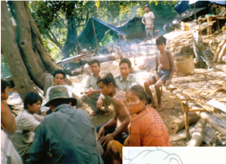
Appendix a: Smoked fish is being prepared by the seasonal fishers at O'talash during fish migration from the tributary to Mekong River.