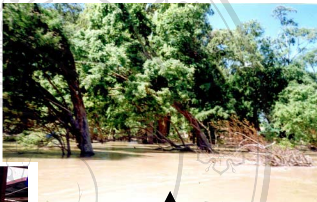
Appendix g: The flooded forest in the Mekong River in Koh Sneng commune, Stung Treng Province.