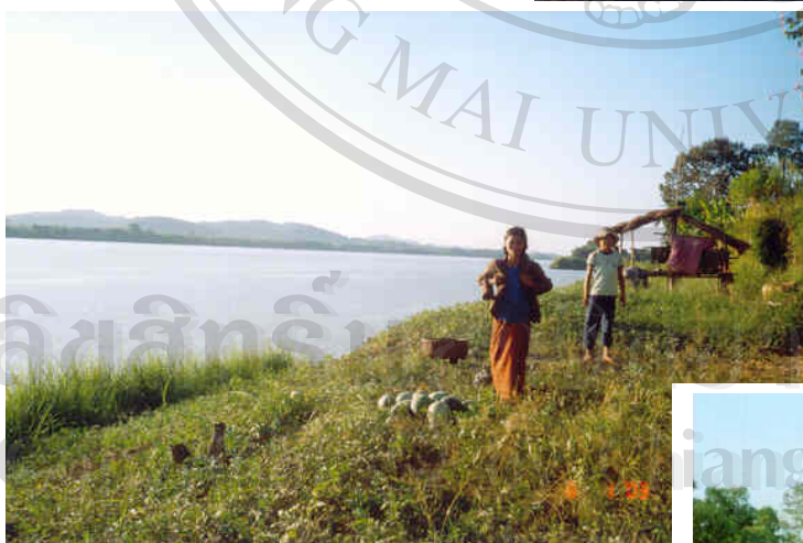
Appendix c: A woman and her son are picking watermelon at her garden on the riverbank in Koh Sneng for the morning market at Stung Treng.