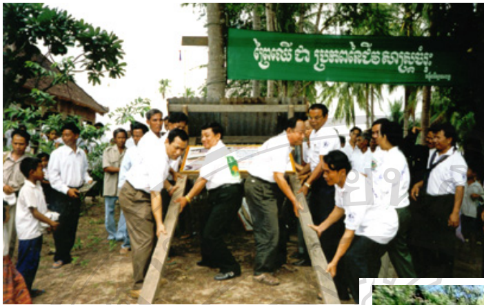
Appendix e: The provincial authorities and NGOs workers are installing signboard of three endangered fish species: Giant-catfish , Probarbus jullieni and Giant barb s in the landing port of Koh Sneng village during the World Environmental Day on June 2001 as the symbolic of fish conservation.