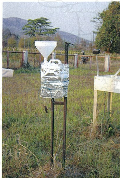
Figure 2.2 Self constructed bulk collector

A scare crew was constructed and placed nearby the sampler for prevention of birds in the sampling site and reduction of into reduce bird dropping contamination by in the bulk collector. A scare crew is shown in Figure 2.3.