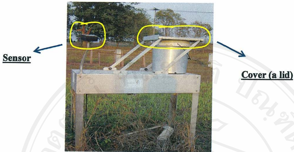
Figure 2.4 Wet-only collector