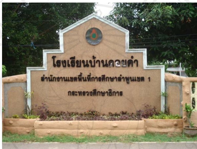
Figure of Ban Doikham School Mae Tha district, Lamphun Province