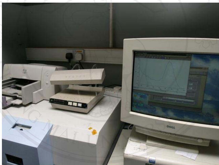
Figure 2.6 Photoluminescence Spectrophotometer.

The Photoluminescence properties of the products were investigated by Perkin Elmer Luminescence spectrometer LS50B at room temperature using an excitation wavelength of 250 nm. The appropriate amount of powder samples were dispersed in absolute ethanol using ultrasonic bath, and tested for emission.