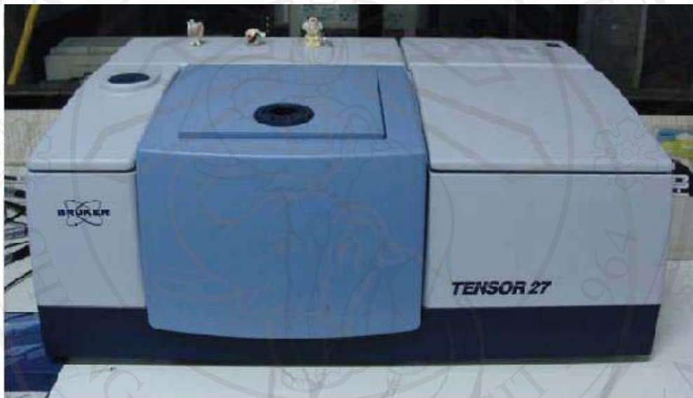
Figure 2.3 Fourier transform infrared spectrometer.

The functional groups of the products were analyzed by Fourier transform infrared spectroscopy (FTIR, BRUKER TENSOR27). The samples were diluted 40 times by KBr pellet and operated in the range 400\text{--}4000\text{ cm}^{-1} for FTIR analysis.