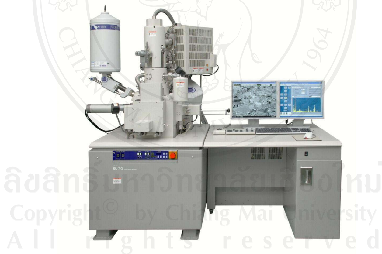
Figure 2.4 Field Emission Scanning Electron Microscope.

The morphology of the products were analyzed by Field Emission Scanning Electron Microscope, JEOL model SEM, JSM-6335F operating at 15 kV as a accelerating voltage. The products were dispersed in absolute ethanol using an ultrasonic bath. The dispersed samples were dropped on conductive gold tape which were attached to the SEM stubs. The stubs were then coated with gold particles by sputtering under argon atmosphere in order to increase conductivity of the samples.