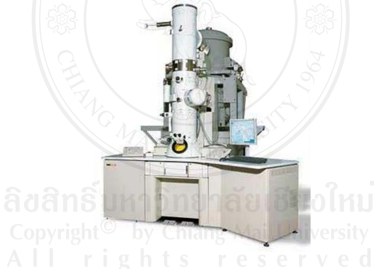
Figure 2.5 Transmission Electron Microscope.

The morphology and structure of the products were characterized by Transmission Electron Microscope, JEOL model JEM-2010 operating at 20 kV. The samples for TEM analysis were prepared by dispersing their small amount in absolute ethanol and put a drop of the solution onto copper grids coated with holey carbon films and letting the ethanol evaporate solely in ambient atmosphere.