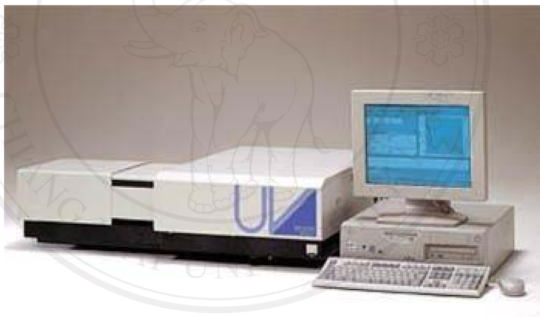
Figure 2.7 Ultraviolet- Visible Near-Infrared Spectrometer.

The optical properties of the products were analysed by Perkin Elmer Lambda 25 UV-vis spectrometer by at room temperature. The appropriate amount of powder samples were dissolve in absolute ethanol using ultrasonic bath, and tested for optical properties.