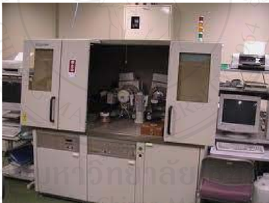
Figure 2.2 X-ray diffractometer.

Crystallinity and phase purity of the products were analyzed by using X-ray diffraction (XRD) with Cu K_{\alpha} radiation ( \lambda = 1.5418 \text{ \AA} ) operating at 20 kV-15mA, at a scanning rate of 5^{\circ}/\text{min} in the 2\theta range of 10^{\circ} - 60^{\circ} . The products were interpreted by Philips X'pert Highscore Computer Software (search-match program) on the database of JCPDS software.