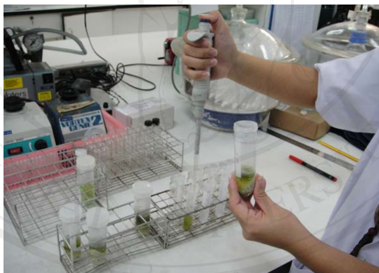
Figure A-6 The cleaning up the samples by SPE alumina