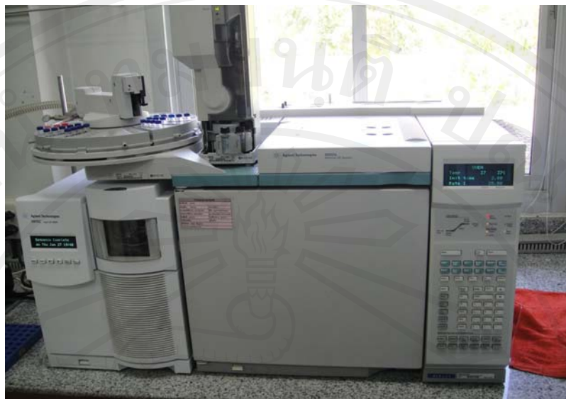
Figure A-9 The analyte samples by GC-MS