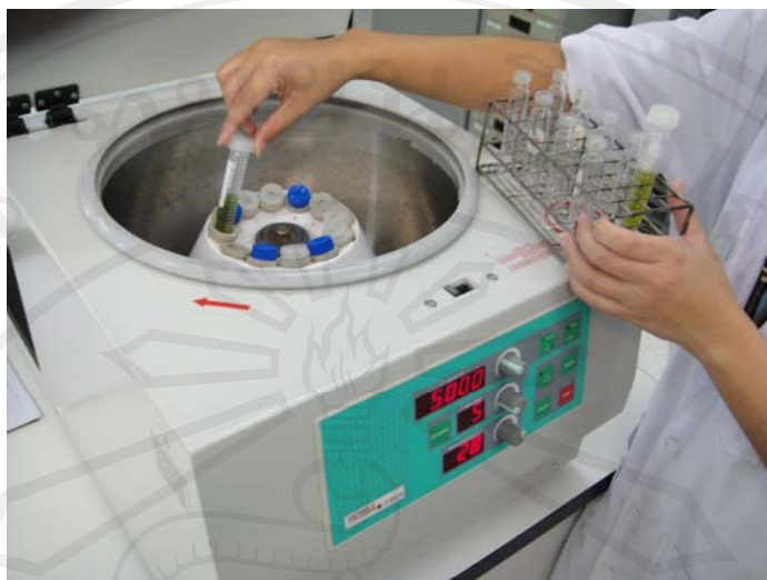
Figure A-5 Centrifuge samples at the speed of 5000 rpm for 5 minutes