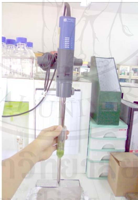
Figure A-4 The extraction by homogenizer for extraction