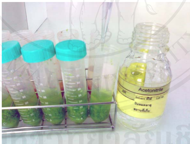
Figure A-2 Add 10 ml of acetonitrile and put them in 50-ml centrifuge tubes