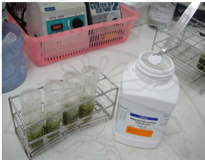
Figure A-3 Add 2 grams of sodium chloride for increase the efficiency of extraction