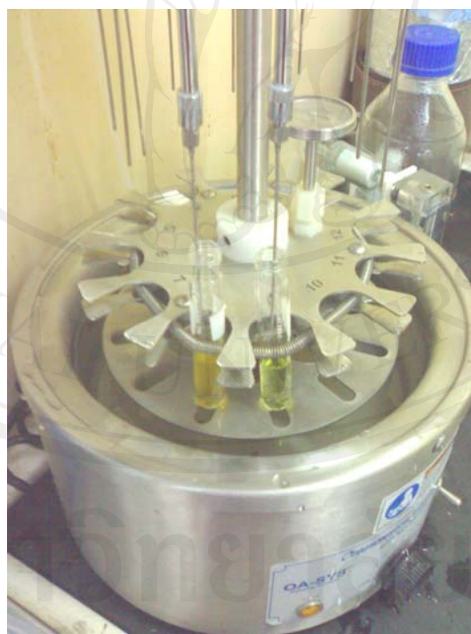
Figure A-8 Evaporate samples by nitrogen evaporator