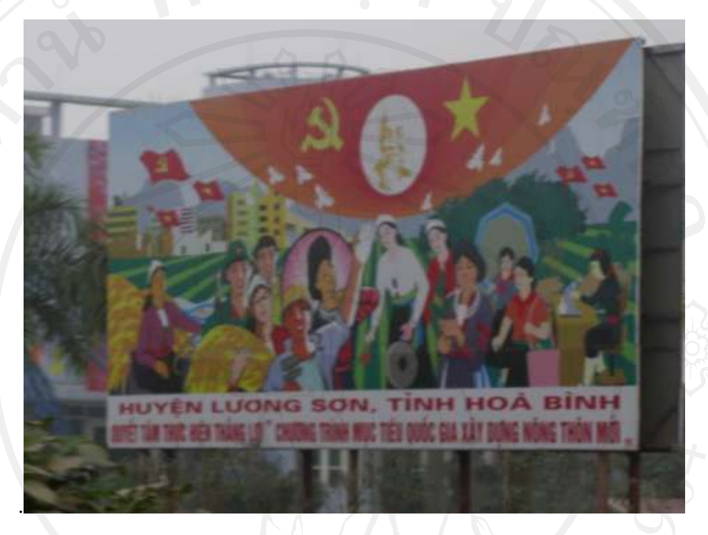
Figure 4.2 Lurong Son district - determine to fulfill successfully the national program of constructing new countryside

from that of the Kinh, is the way of social exclusion the ethnic groups as change agents in the economic development process.