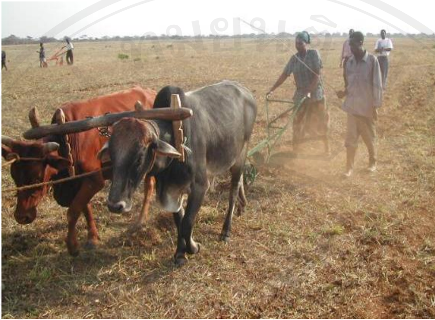
Figure 6: Traditional tillage with single mouldboard plough.