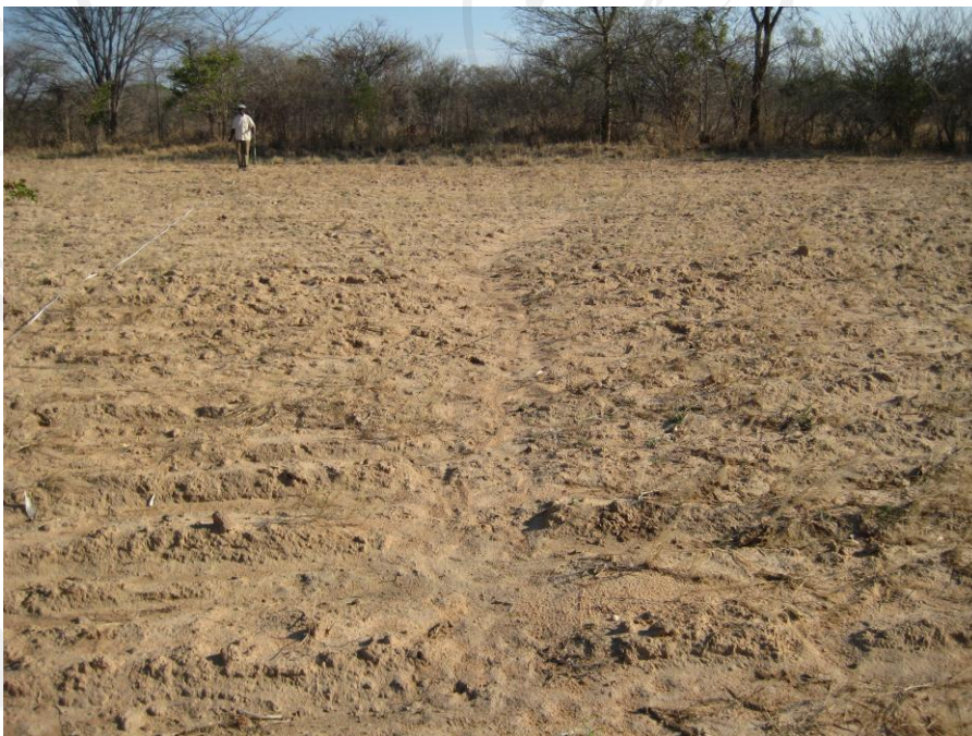
Figure 7: Typical ploughed field, Nkyai District, Zimbabwe. End of dry season, 2011 with bare ground, high surface temperatures, surface crusting, and evidence of erosion.